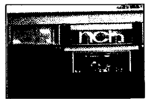
New Century Halls Drop-in: Tues. 10.00am-1.00pm Wed. 1.00pm-4.00pm