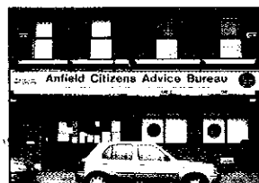
Anfield CAB Drop-in: Mon, Tues & Thurs. 10.00am - 1.00pm

or email your comments or contributions to: admin@northliverpoolcab.co.uk