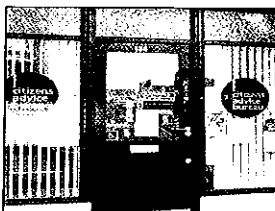
Norris Green CAB Drop-in: Mon, Wed. & Fri.. 10.00am - 1.00pm