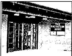
Walton CAB Outreach at The Salvation Army Cavendish Drive