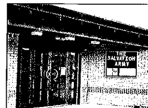
Cavendish Drive, Walton Drop-in: Thurs. 10.00am - 2.00pm