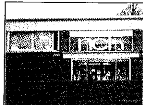
New Century Halls Drop-in: Tues. 10.00am-1.00pm Wed. 1.00pm-4.00pm